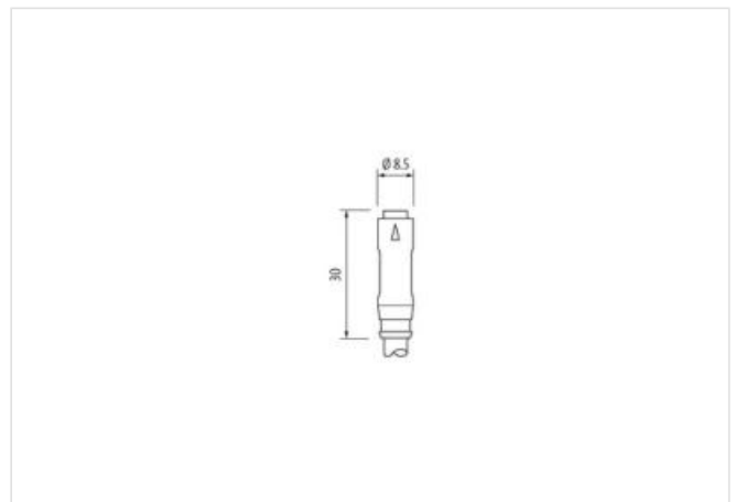
Produktet kan afvige fra billedet