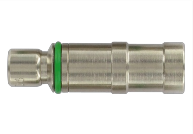
Product may differ from Image

Insert - stationary housing Brass, nickel plated with shut-off AD6